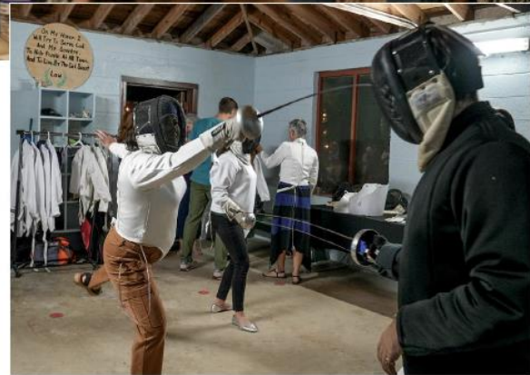
TOP: GLAMPING WITH GIRL SCOUT ALUMNI ON-STAGE SAYING THE GIRL SCOUT PROMISE AND LAW. ABOVE: A GUEST TRIES FENCING WITH DAVIS ACADEMY FENCING